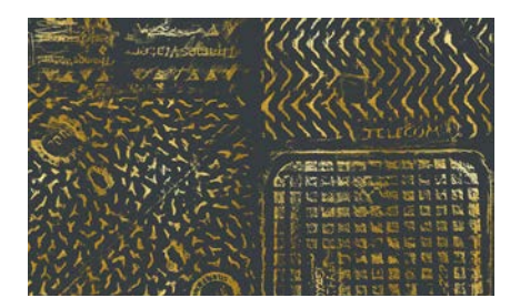
Gold on Eclipse