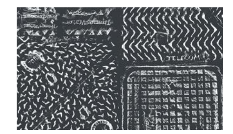
White on Black