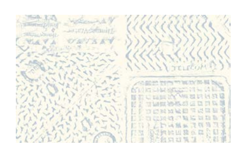
Sky on Cream