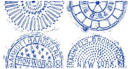
Blue on White