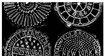
White on Black