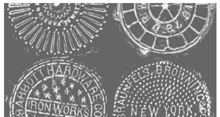
White on Charcoal