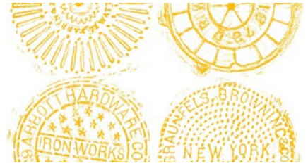
Gold on White

Scan the QR code with the camera on your mobile device to view the pattern in your room digitally.